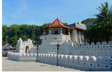
Sacred Tooth Relic.

(Optional) Visit the famous Temple of the Sacred Tooth Relic followed by the Kandy Cultural Show.