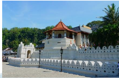
Sacred Tooth Relic.

(Optional $ 10.00 Per Person) Later that evening, visit the famous Temple of the Sacred Tooth Relic followed by the Kandy Cultural Show.